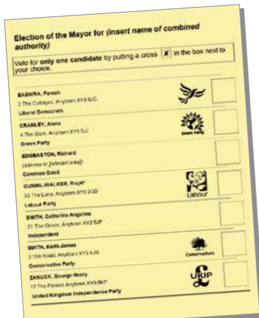
Example ballot paper